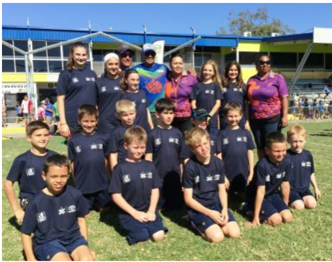
Ty Williams Cup