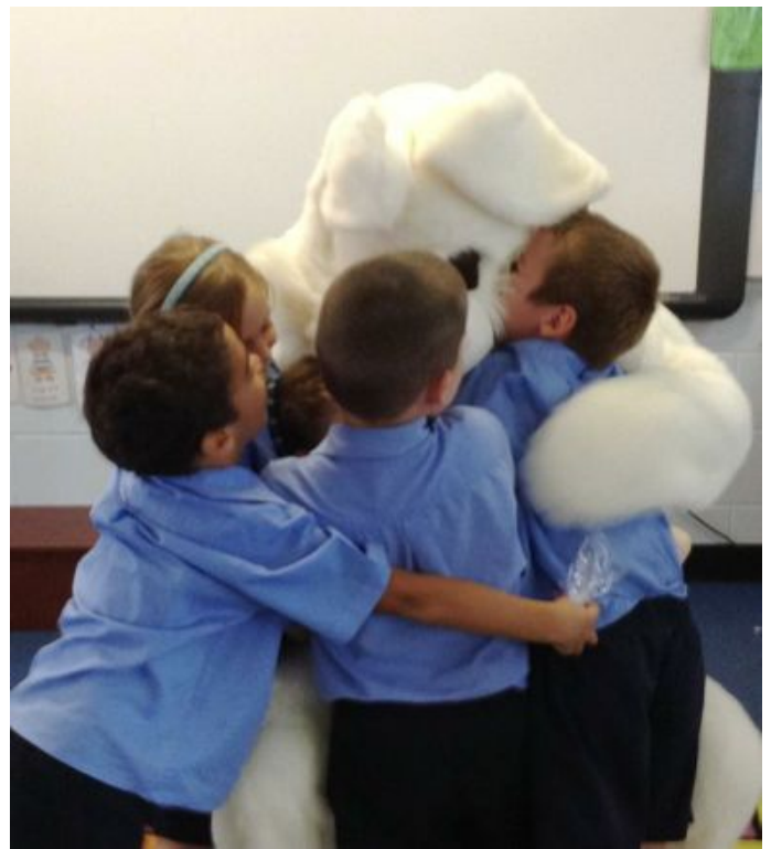
A special visitor