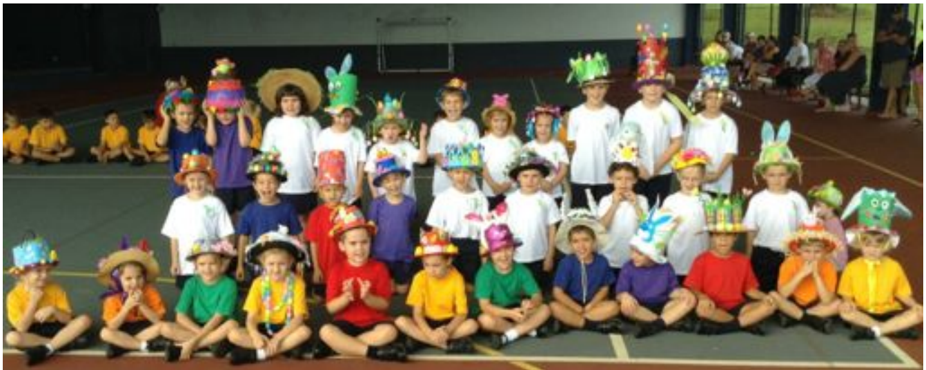
Yrs 1 & 2 and their Easter Bonnets