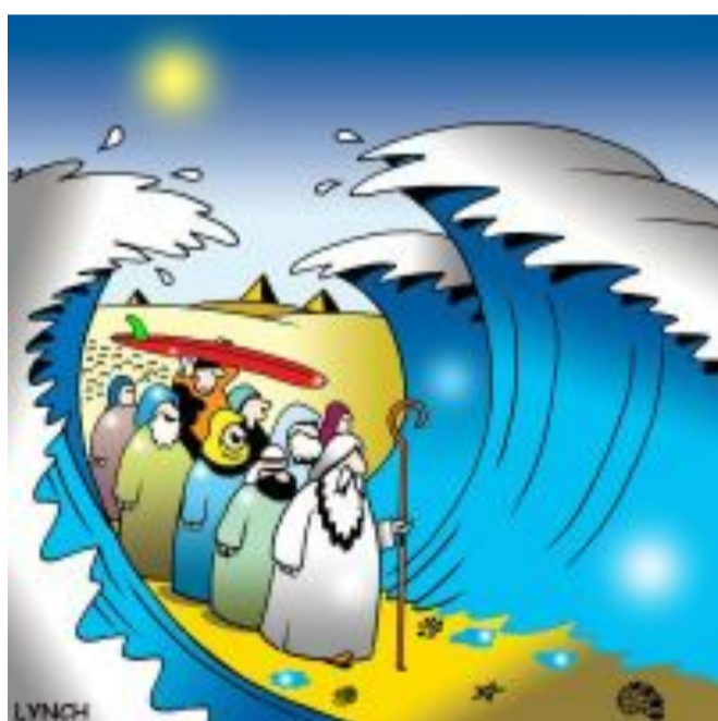
Moses, parting of the Sea