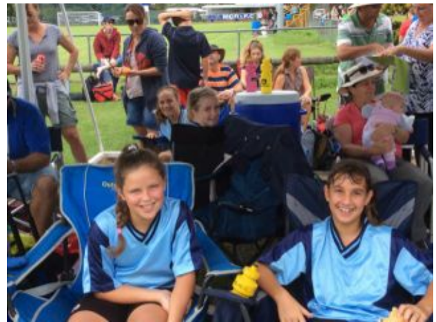
PENINSULA GIRLS SOCCER