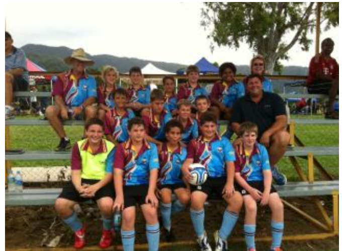
PENINSULA BOYS SOCCER