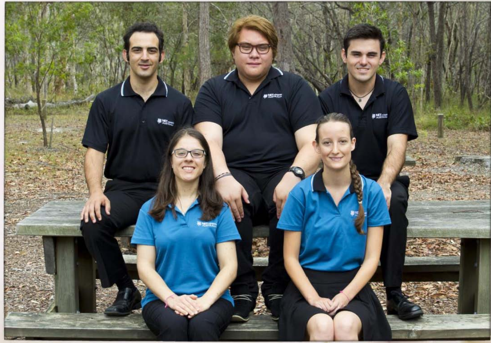
NET Team 2014

A warm welcome is extended to the NET Team members who will be in our Parish and School's for the remainder of this year working in Youth Ministry.