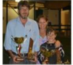
Winners are Grimmers