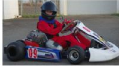
Another Race Win in the bag