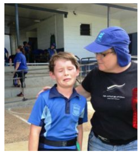
'It's OK, we'll let you win soccer next week'.