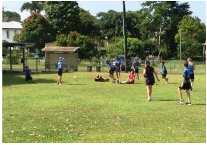
It looks like things got rough.