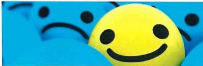
Free workshop — Community Support Centre Innisfail Inc., primarily funded by Department of Communities