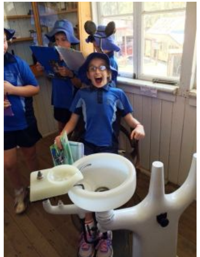
The dentist chair!!