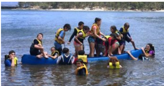
Team building balance exercise