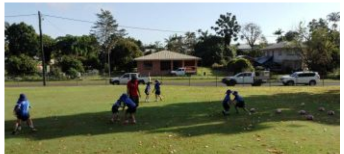
Rugby Skills Clinic in action this morning