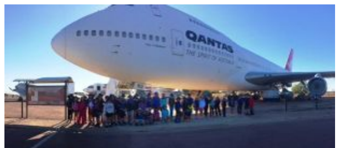
At the Qantas Museum