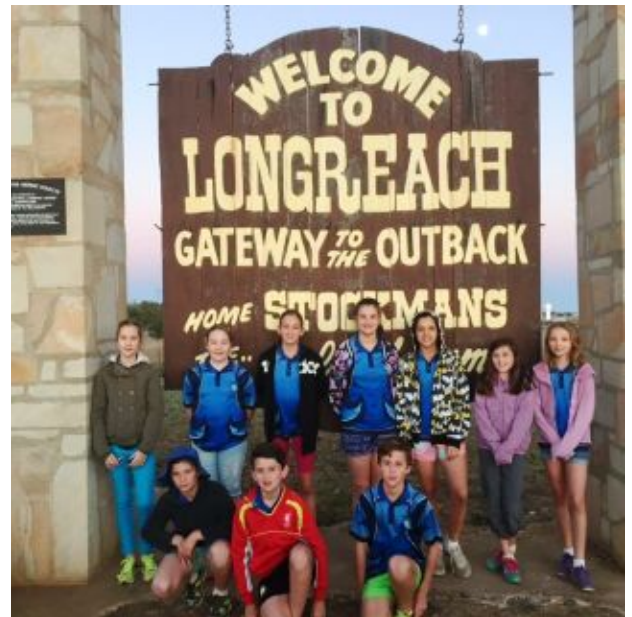
Morning walk – 10 degrees