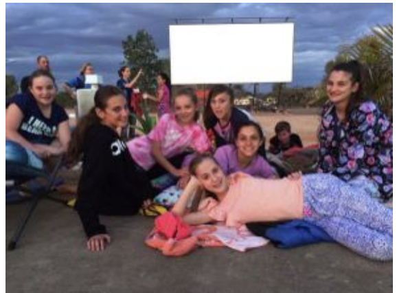
The drive-in behind - how many of them know what a drive-in is?