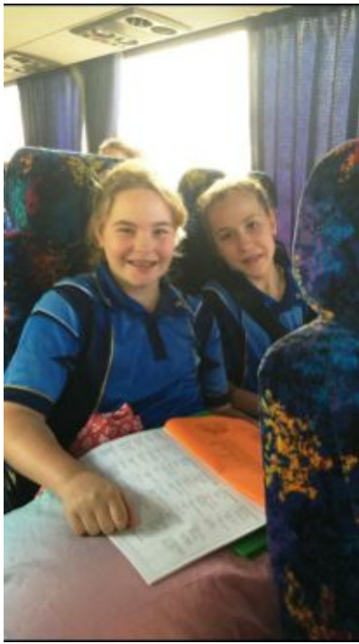
The wheels on the bus go ....