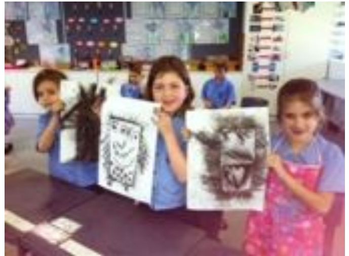
Year 2s have fun with charcoal