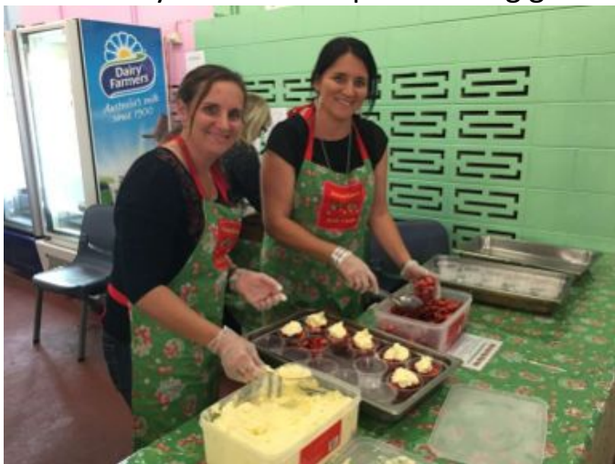
Strawberry & Cream Helpers looking good