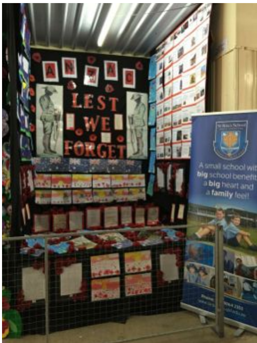
Our show display exhibited lots of work by our students