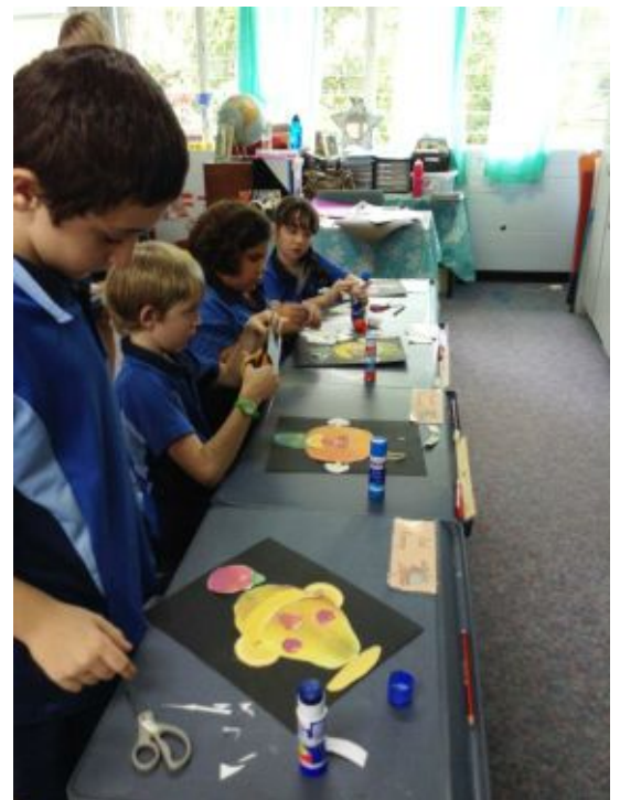
Yr 3 make their fruit faces