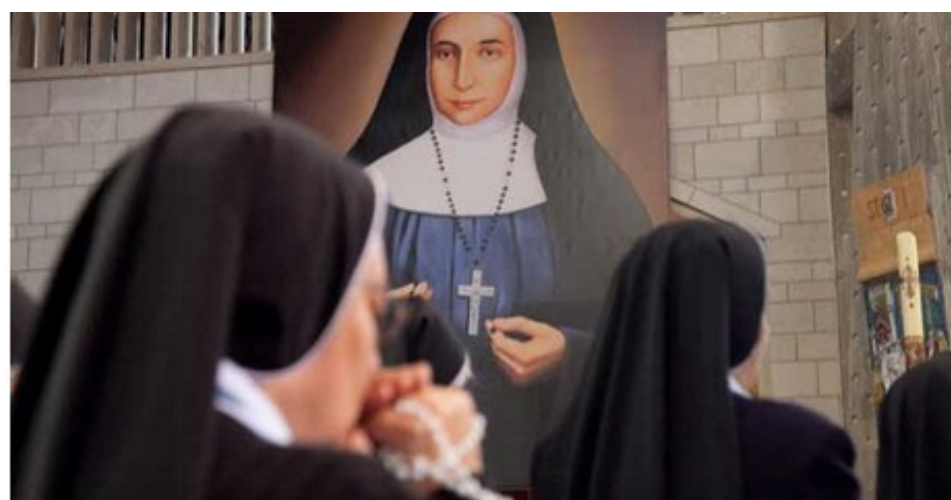
Sisters work invaluable

A church without religious sisters would be 'unthinkable', Pope Francis said, while honouring the contributions consecrated men and women make to the Church and society, reports the Catholic News Service.