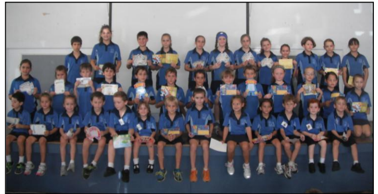
Week 4 - Assembly Awards